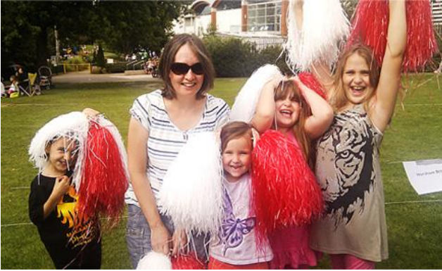
Lots of fun was had at the Horsham Carnival

Thank you for everyone who turned up and participated in this event. We had a great day in the sun and danced in front of the crowds at this packed event. The event was well covered by the local papers and there are some photos on our website too.