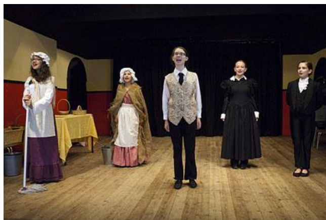
Students perform their devised show – Dreams of Love

Great fun was had by all on this year's summer course with students devising a great musical show using Broadway songs. Students also researched the musicals and designed the poster and programmes themselves, so very well done to all.